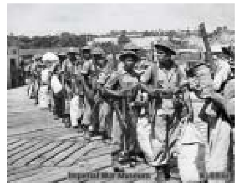
Troops of the Fiji Infantry Regiment preparing for overseas service against the Japanese in the Solomon Islands.

Write an article about the heroic Pacific Islanders for Time magazine and illustrate it with photographs or drawings. Add comments from American marines and survivors who served alongside the Islanders.