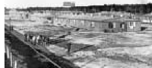
Stalag Luft III prisoner of war camp, scene of the 'Great Escape' in 1944.