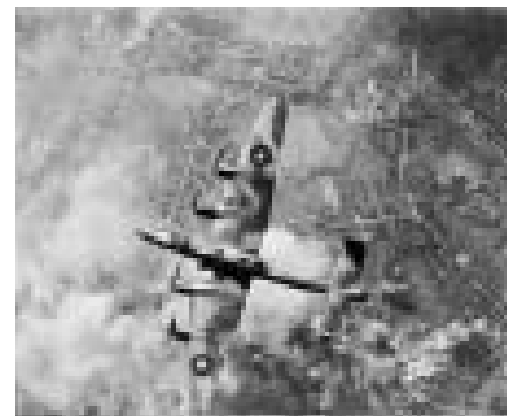
An aerial photograph taking during a daylight raid on an oil refinery in the Ruhr.

After the war he studied law and qualified as a barrister but went onto become an actor and entertainer. In the 1970s he founded Drum the London based black arts centre and was the director of the Concord Multicultural Festivals in the 1980s.