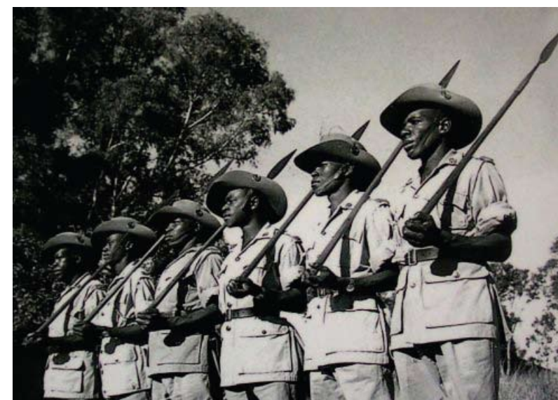
Soldiers of the South African Native Military Corps issued with assegais instead of rifles