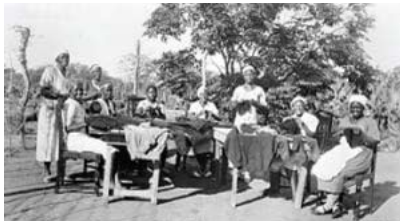
On the African homefront a group of women of Palapye, Bechuanaland knit clothes for the Navy League.

Talks were held between British, South Africans and native chiefs, and agreement was reached to establish the African Auxiliary Pioneer Corp (AAPC).