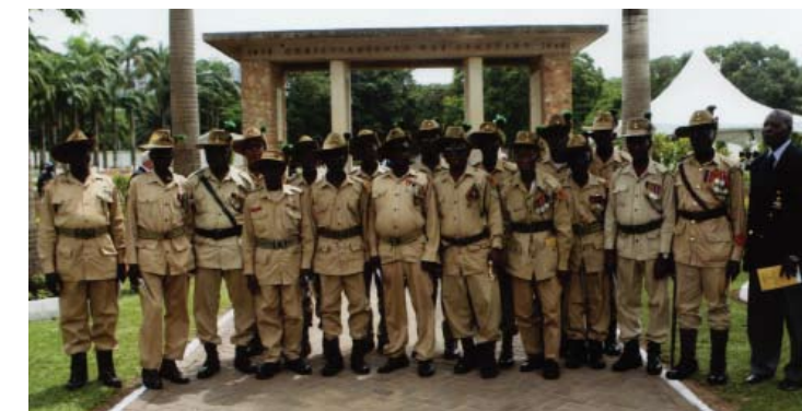
RWAFF veterans in Ghana, 2008