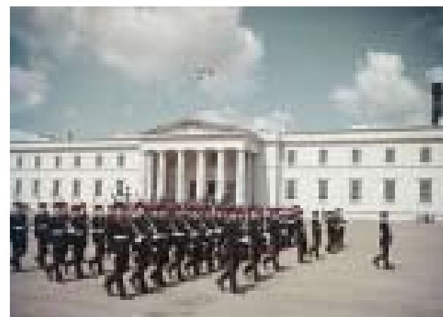
Officer cadets march in a Passing Out parade at the Royal Military College, Sandhurst

By September 1939, Anthony was ready for war. His battalion was involved in guarding Takoradi harbour and operating coastal defences, as this was where British aircraft meant for the North African campaign were shipped and assembled here.