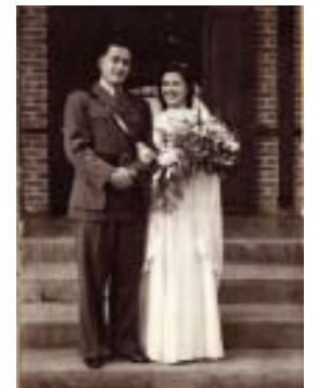
Wedding day, 1949