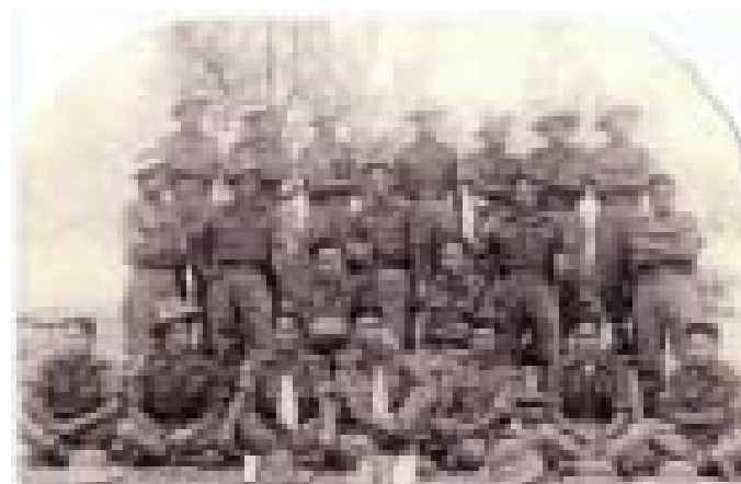
Group photo taken at a jungle training camp December 1944